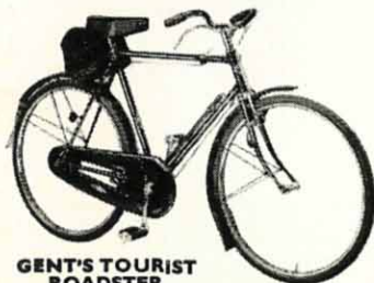
GENT'S TOURIST ROADSTER

For those who are interested in a "powered bicycle," there is the 'Sun' Autocycle, fitted with a 98 cc. 2-stroke engine.