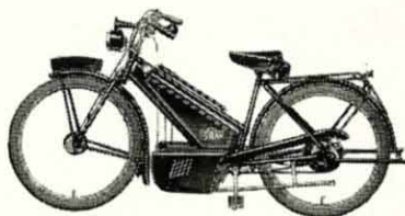
THE 'SUN' AUTOCYCLE

Sun Cycles BRITAIN'S PREMIER LIGHTWEIGHTS