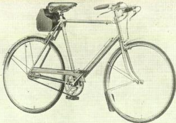
Raleigh Lenton Tourist fitted with Sturmey-Archer 4-speed gear