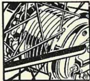
INTERNAL EXPANDING REAR HUB BRAKE