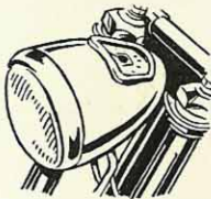
POWERFUL DIPPING HEADLAMP