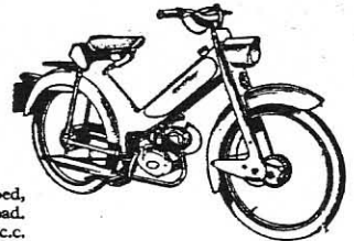
SUPER LIDO The luxury moped, the smartest ride on the road. Specification includes Sachs 50 c.c. engine, swinging arm rear suspension. 73 gns. tax paid