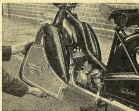
Modern lines of the restyled New Hudson autocycle.

Every New Hudson dealer has been notified concerning the double-column advertisement blocks for use in their own local papers and financial assistance from BSA will be given to tie-up with the advertising campaign; there are special window bills, literature, and price guides.