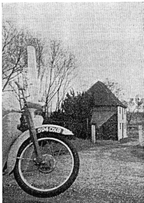
A typical scene near St. Albans, an area abounding in quiet byways.

But time was pressing, and I slipped between Berkhamsted and Hemel Hempstead and worked my way to Watford, there to exchange the delights of the open road for the all-absorbing art of beating London's traffic. The S/2 had proved ideal for both.