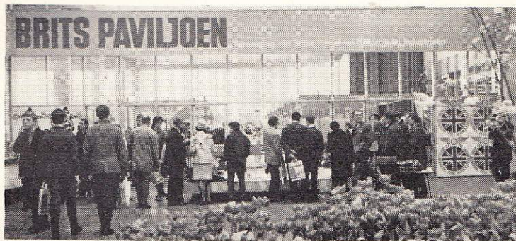
FOREGROUND OF SPRING TULIPS for the British pavilion at the RAI show in Amsterdam: the crowds shown were queuing to go in.