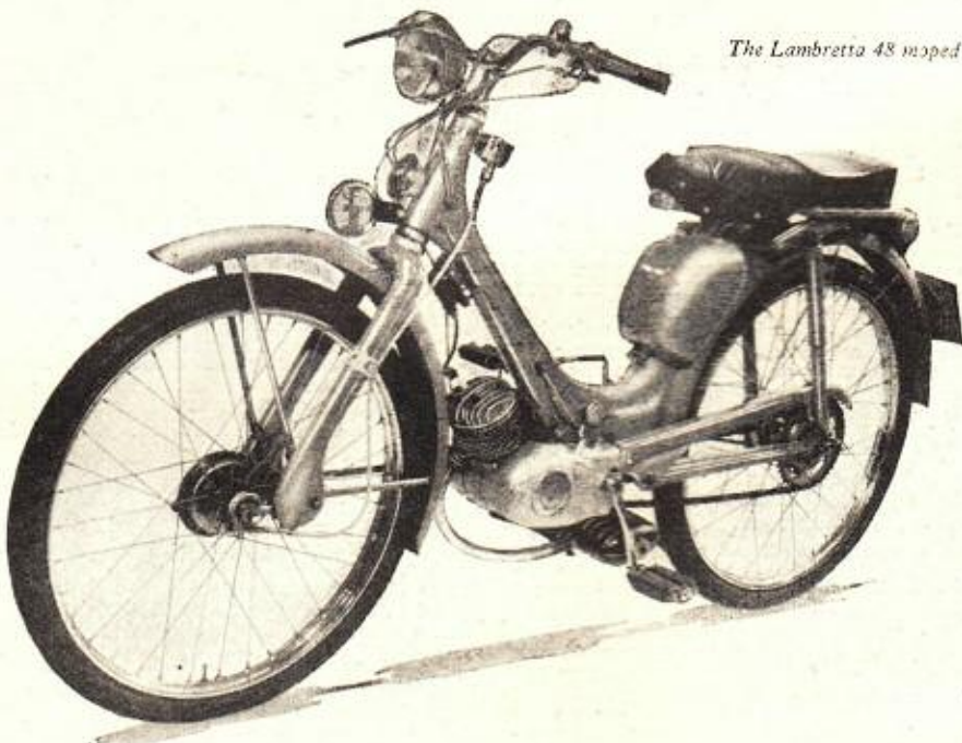
The Lambretta 48 moped