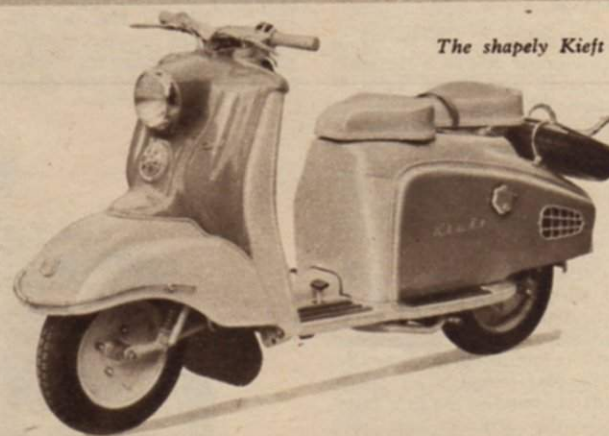
The shapely Kieft scooter

The Kieft scooter has beauty of line and an attractive specification. Power unit is a fan-cooled Sachs two-stroke built integrally with a four-speed gear box and incorporating a Siba Dynastart combined electric starter and generator. Primary drive is by gears and the rear chain is fully enclosed.