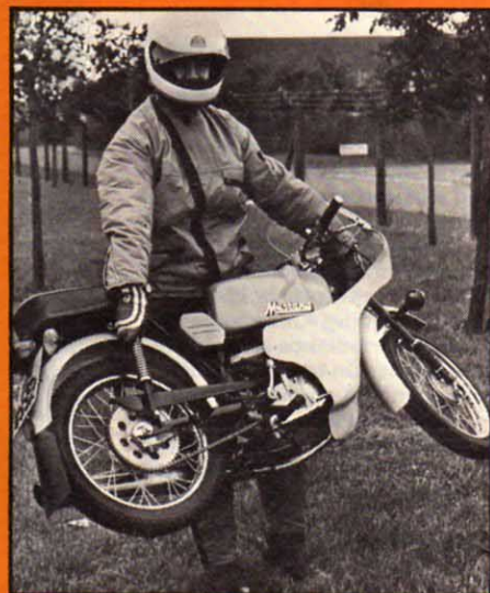
Light to handle — that's the Mustang.