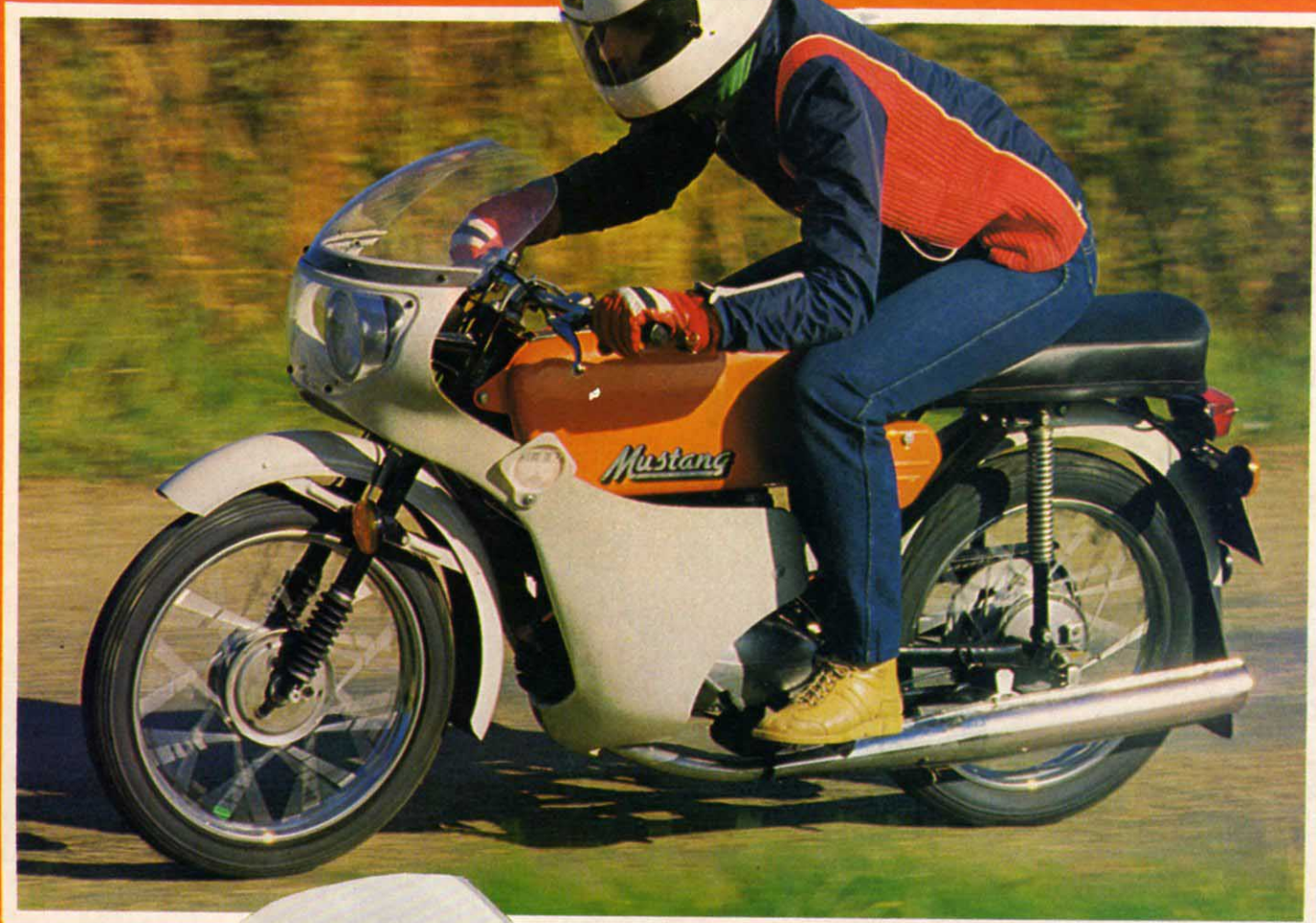
Above: The Mustang takes to the road.