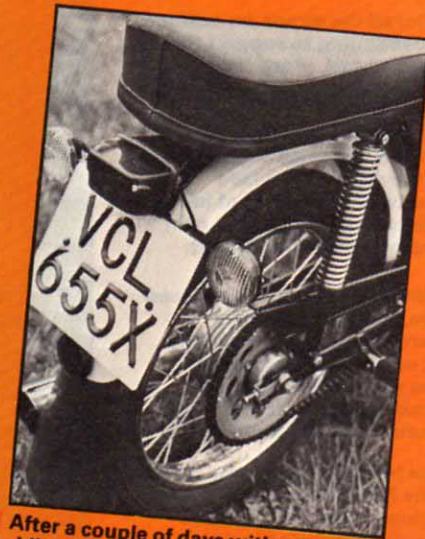
After a couple of days without riding, the wipers didn't work until the bike had clocked-up a few miles.