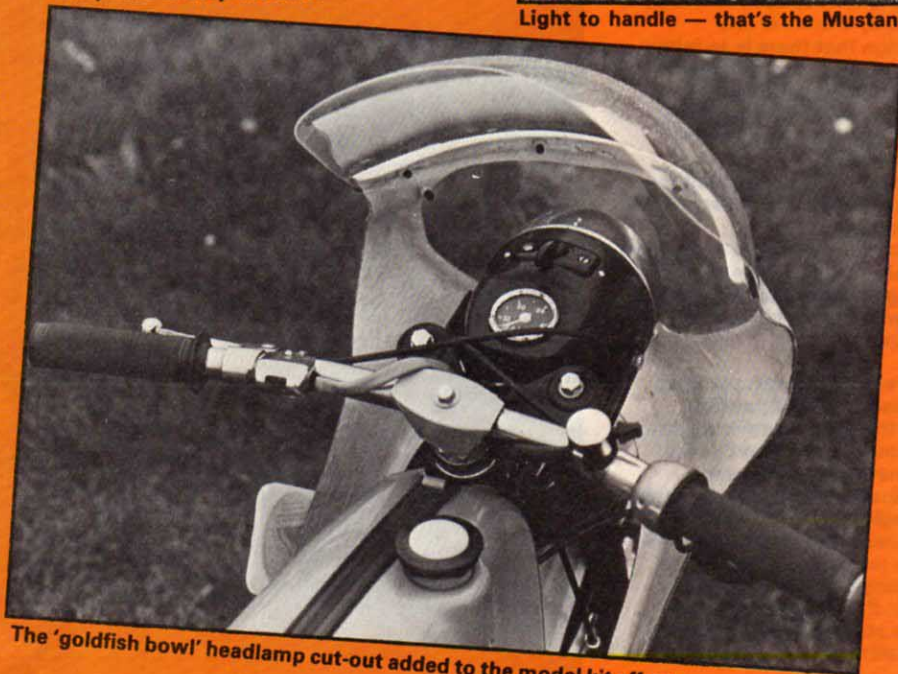
The 'goldfish bowl' headlamp cut-out added to the model kit effect.

£65 less) but it lacks the refinement of many of the other breeds in this class.