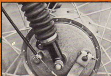
The drum brakes had to be squeezed fairly hard to stop the bike.

The Jawa 50 may have had a face-lift but it's still an 'old' style bike underneath. Without the fairing I think it looks a reasonable small motorcycle (and it costs