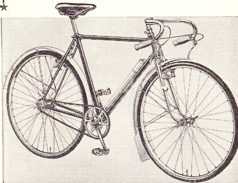
The James "Grande Prix Super Sports," costing £7.15.0