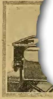
The Brooks cantilever halves of the

very neat automatic carburetter of small size is fitted, and the rocker gear for the overhead inlet valve is contained within the induction pipe. The valve chamber is separated from the cylinder by a large air space to assist in cooling, and mechanical pump lubrication with a large oil sump is provided. An