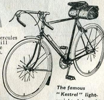
The famous "Kestrel" light- weight club model

Your local Hercules Dealer will show you the latest models.