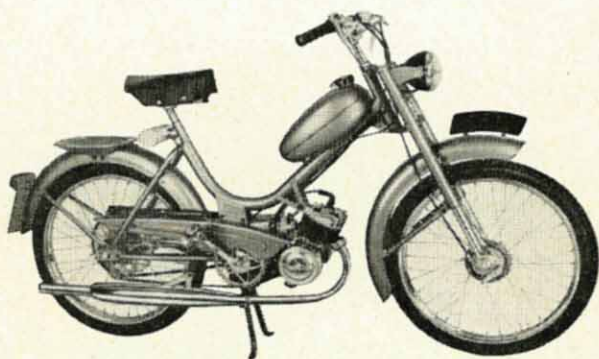
Garellino single speeder with auto- clutch

We have had the opportunity of a fairly prolonged test on one of these engines using two craft, a light sailing hull which used the speed capacity of the motor to the full and a heavier 12-foot utility boat with four people up. The jet system works well and provides full performance from the lively 87 c.c. engine with quite exceptional manoeuvrability at low speeds. It can of course, be used in weed or mud and up against banks where an ordinary propellor cannot operate, but the really big appeal is in its safety as no damage can be done to swimmers or surf boarders even if they come into direct contact with the drive.