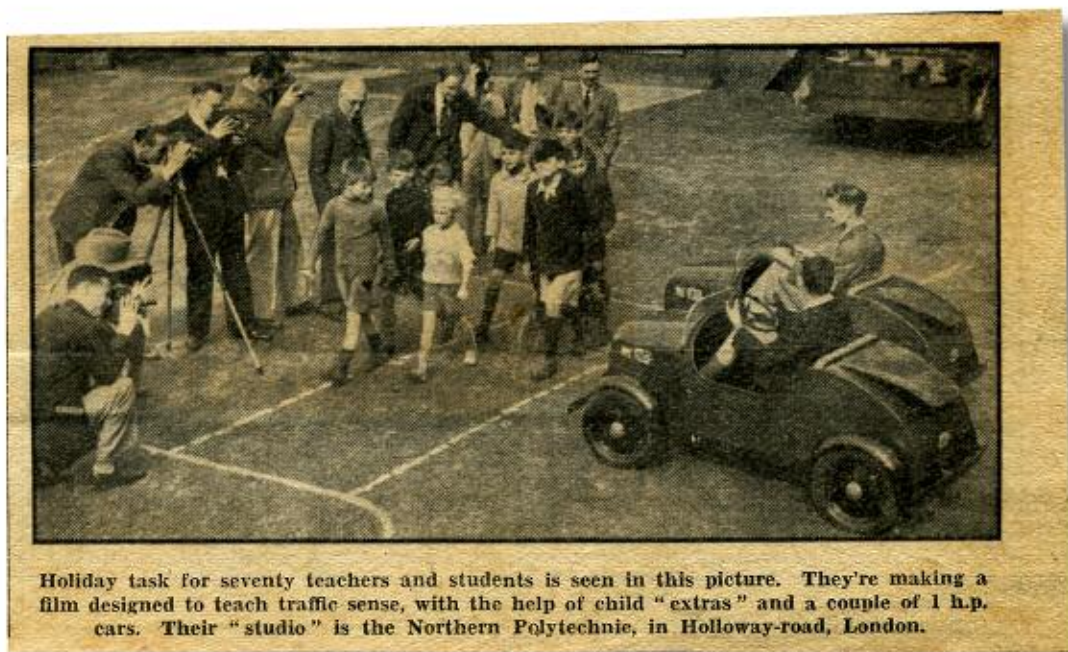
Holiday task for seventy teachers and students is seen in this picture. They're making a film designed to teach traffic sense, with the help of child "extras" and a couple of 1 h.p. cars. Their "studio" is the Northern Polytechnic, in Holloway-road, London.