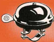
No. 949 NP/CP