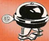
No. 848 "Juvenile"