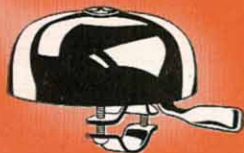
No. 343 "Master"

Illustrated Literature and quotations will be sent on request.