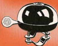
No. 646 "Adie"