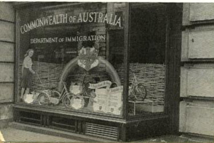
Picture shows the Aberdale Cycle Company's attractive display of their Gresham Flyer children's tricycles in one of the windows of Australia House, London, during the week of the Royal Wedding

In conjunction with this and other export efforts the Aberdale concern is now making, a beautifully designed catalogue has been produced. Printed on good quality paper in colour, this is one of the best efforts a cycle manufacturer has yet made at catalogue work, comparing favourably with the high standard of printed publicity set by the British motor industry.