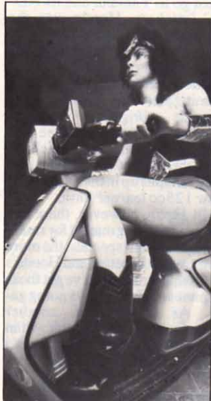
Another job well done.

Good looks are important too. How many crime fighters do you see on MZs? We both liked the angular lines, the ample leg room and the aerodynamic front guard. We