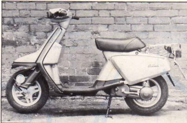
The ultimate crime fighter's chariot.

were as one on the Salient's carrying capacity. No basket, as found on the Honda competitor, but a good size carrier at the back, with bungee hooks and a front luggage compartment that will cater for a brace of two litre bottles of cheapo plonko.