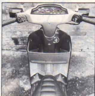
Plenty space for spare undies if required.

With that she was gone — crime waits for no one. I fired the trusty CA50M and wended my way into the drizzle, hatching a plan to scam one for a year of long term luxury. WB?