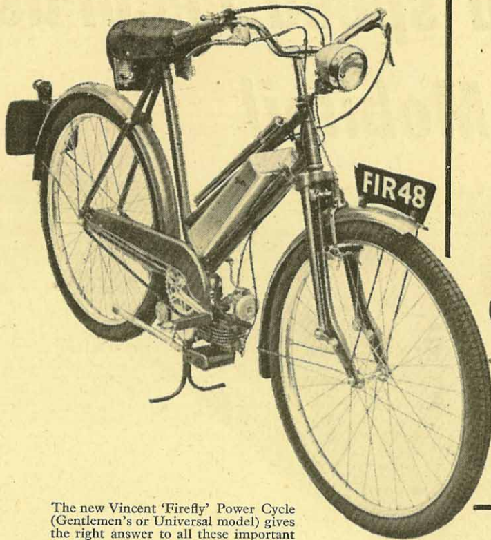
The new Vincent 'Firefly' Power Cycle (Gentlemen's or Universal model) gives the right answer to all these important questions:—