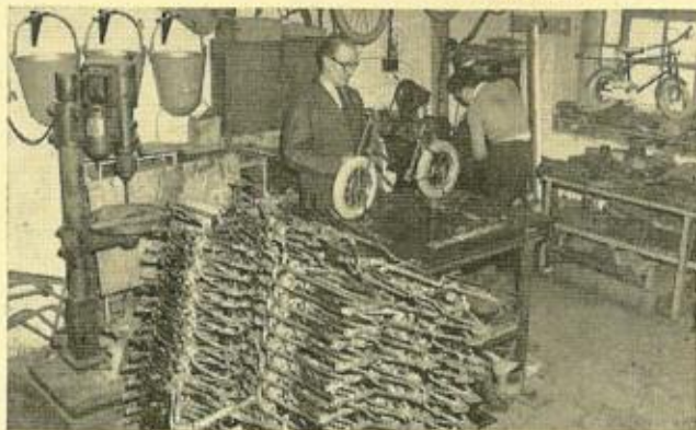
Above: A corner of the assembly shop showing work proceeding on a balloon-tired junior model.

Two years later, he was to be seen 'on the road' with his bicycles on a wheel-barrow! Not to be denied success he became sales man-