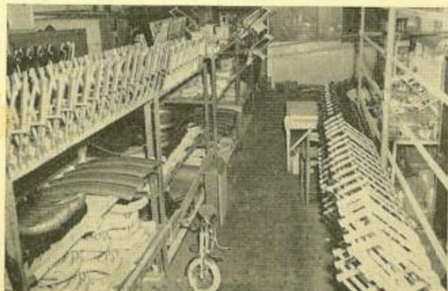
Left: A section of the Trusty frame and mudguard stock.