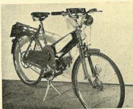
The London-built Talbot moped, which sells at less than £50. It is made by H. J. Talbot and Son, of 7 Central Hill, London, S.E.19.

The Talbot has a Trojan 49 c.c. engine, petrol consumption of 200 miles a gallon, drive through a V-belt and chain, single twist-grip control, Webb forks, a five-pint petrol tank and Sturmey-Archer Dynohub hub-lighting equipment.