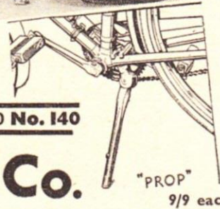
"PROP" 9/9 each