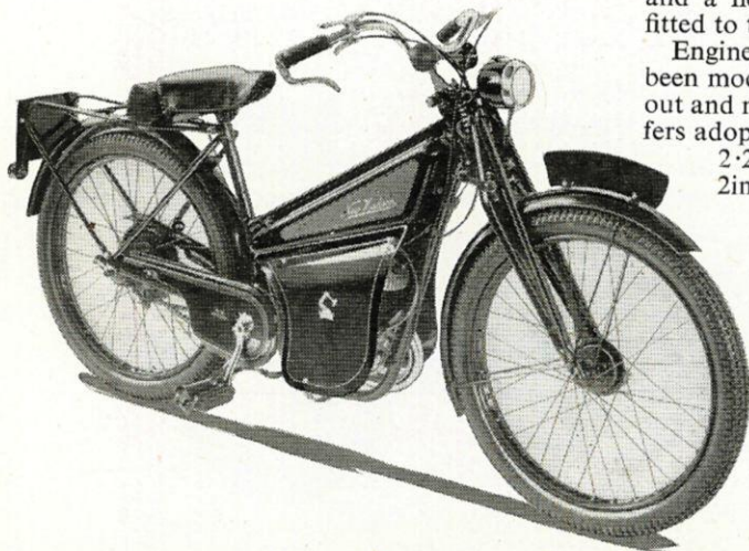
Petrol tank, engine and a redesigned loop frame are all new features

Engine shields and chain guard have been modified to conform to the new layout and new tank and engine shield transfers adopted. Front and rear wheels have 2.25—2.1in tyres instead of 26 by 2in as on previous models.