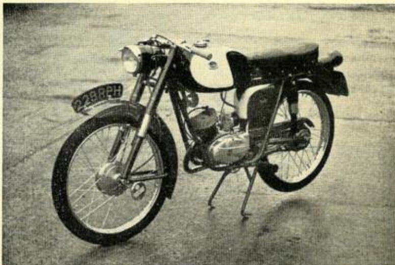
The Mondial is of sturdy construction and sporting appearance

Saddle height is reasonable at 29-inches and overall weight at 176 lbs. puts the Concorde in the genuine lightweight class. It is no "miniature" however, and provides