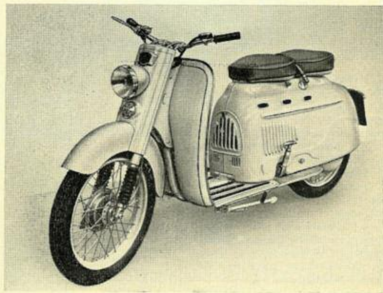
The Concorde. Note the hand starter on the left of the machine that can be operated while seated

As a solo the Standard model will cost £109 3s. 4d. including P.T. with a pillion seat available at £2 15s. 0d. extra. The De Luxe model will be £125 9s. 0d.