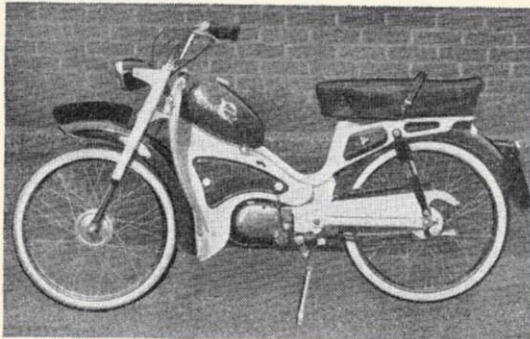
DE LUXE SCOOTERETTE attractively finished in red and beige and fitted with large legshields and engine covers. It has a three-speed gearbox.

The Capitano range of machines, comprising Automatic de luxe moped, two-speed moped, three-speed de luxe Scooterette and 48cc Grand Prix sports motor cycle, continues unchanged, but one very interesting newcomer will make its first public appearance on the Kerry's stand at Earls Court. Named the Week-End Cross, the machine is completely new to Britain and was originally designed for the Dutch market, where it has been a great success. Two versions will be at the Show, but only one will be sold in this country. Both models have an FB Minarelli 48cc two-stroke engine mounted in a duplex frame of similar design to that used on the Grand Prix model. The "Cowhorn" handlebars, unusual tank styling and chromium-plated fittings such as crash-bars at front and rear, wide section guards, handlebar mounted transistor radio holder and one into two exhaust system all combine to give this compre-