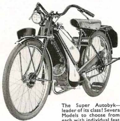
The Super Autobyk— leader of its class! Several Models to choose from, each with individual features.

Wherever you see them—out and about on the roads—on the track— or in trials—an EXCELSIOR will put up a good show all ways—in dependability, in speed and in economical running. The EXCELSIOR Range includes Lightweight Motor Cycles and Autobyks from 98 c.c. to 250 c.c. with sprung frames and telescopic forks.