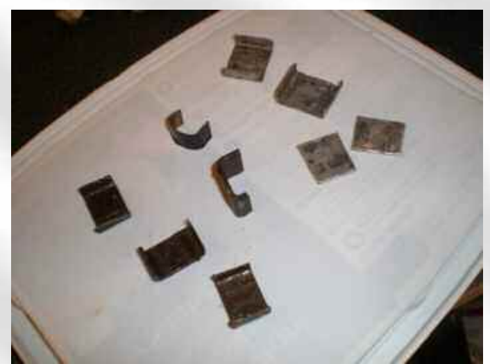
Imagine some guys, long dead I guess cutting out these little bits of metal to save money!

The Horseshoe Pub Warlingham last Wednesday of the month 8.pm.