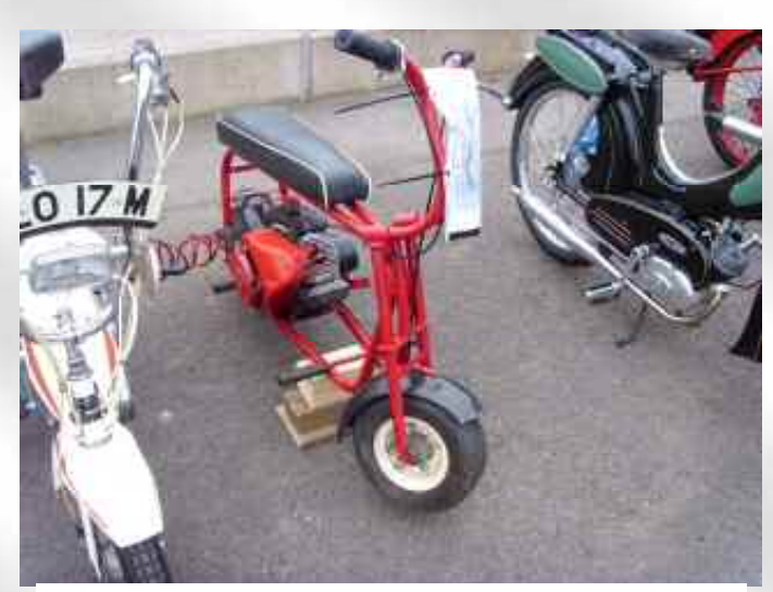
A bike similar to what Mike and his friends created. This one is a Trobike I think.

being a 250 twin it was decided the engine was to big so we then settled for a Bantam engine. The old moped parts that were used included the brakes and the rear sprocket the Mini bike was soon assembled and put to use for riding around the meadow. unfortunately one day one of my friends fell off and caught the heel of his shoe between the rear sprocket and the chain ripping the heel off but apart from that incident the bike ran well.