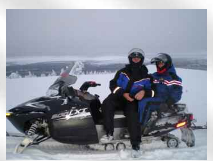
Two snow mobile enthusiasts with their trusty steed. Dont know who they are!

The snow mobile's we hired this year were powered by a 600cc Rotax twin cylinder direct injection two stroke producing 125bhp, pretty powerful huh!. We were back to the good old days, the unending screaming acceleration was back, the machines were and felt so much lighter. I feel that you could just get it, grab it by the scruff of its neck, and go beserk. Snow mobiling is a lot like shall we say "green laneing" with trials bikes. The only disappointment was that in the areas we went this year, we did not venture onto the frozen lakes as in other years. These are the areas where you can really put the hammer down because of the smooth surface. I feel that these machines in the right conditions could easily reach 100mph but it's not the top speed I'm impressed by, it's the manner that 80kmh can be reached, mind boggling!