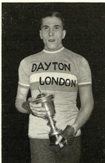
GERRIT PETERS World's Professional Pursuit Champion 1946.

One of the new Dayton 'Quality' mounts now in production; designed for speed, lightness, easy-running and durability. Comprising 73^{\circ} - 71^{\circ} angles and the latest Dayton refinements.