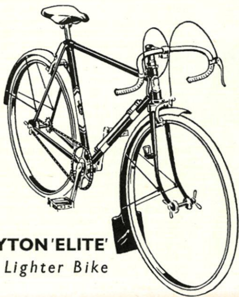
DAYTON 'ELITE' The Lighter Bike