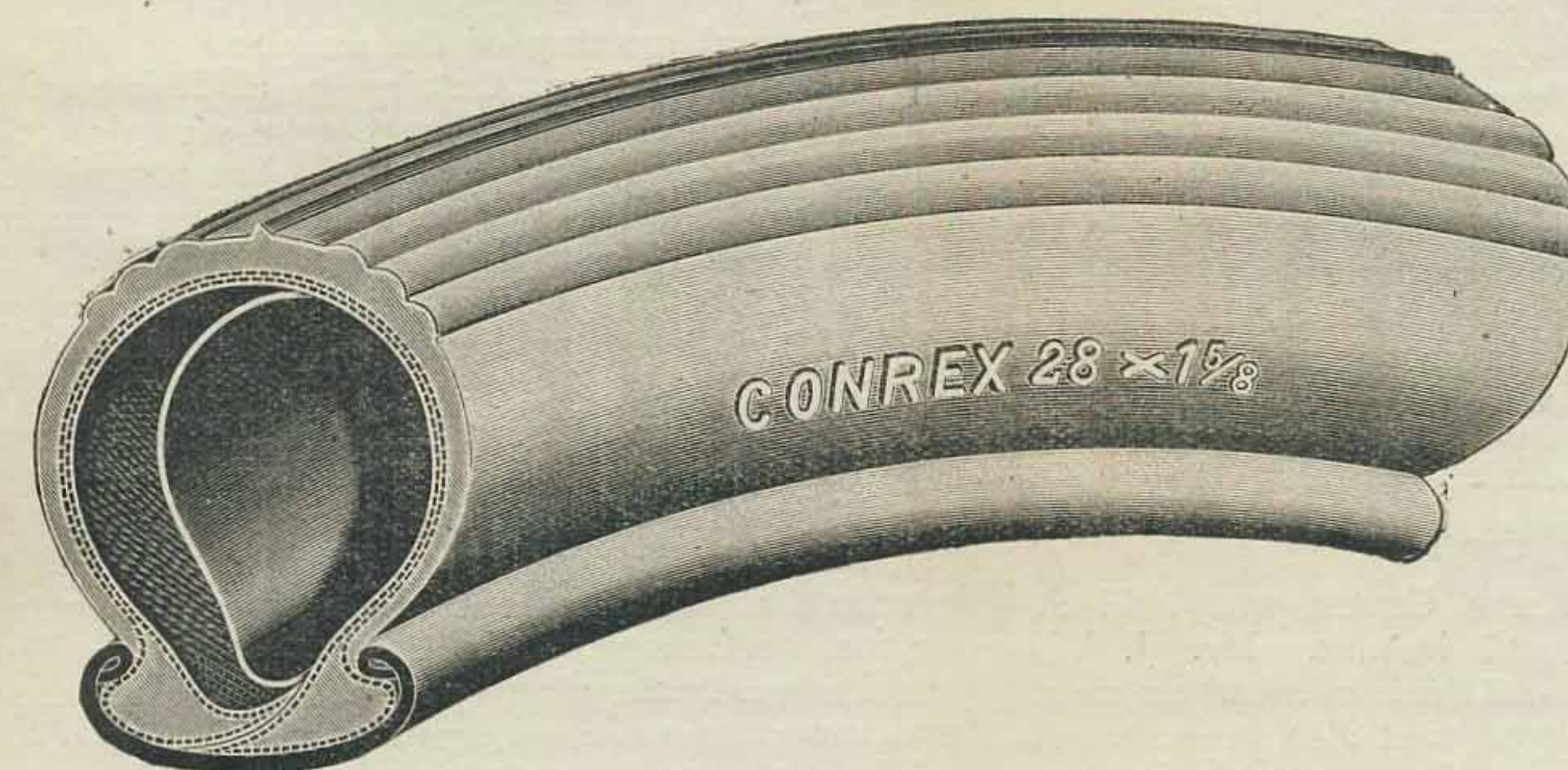
A good Beaded-edge Tyre at moderate price.

RUBBER CO. (Great Britain) LTD., ROAD, LONDON, E.C.