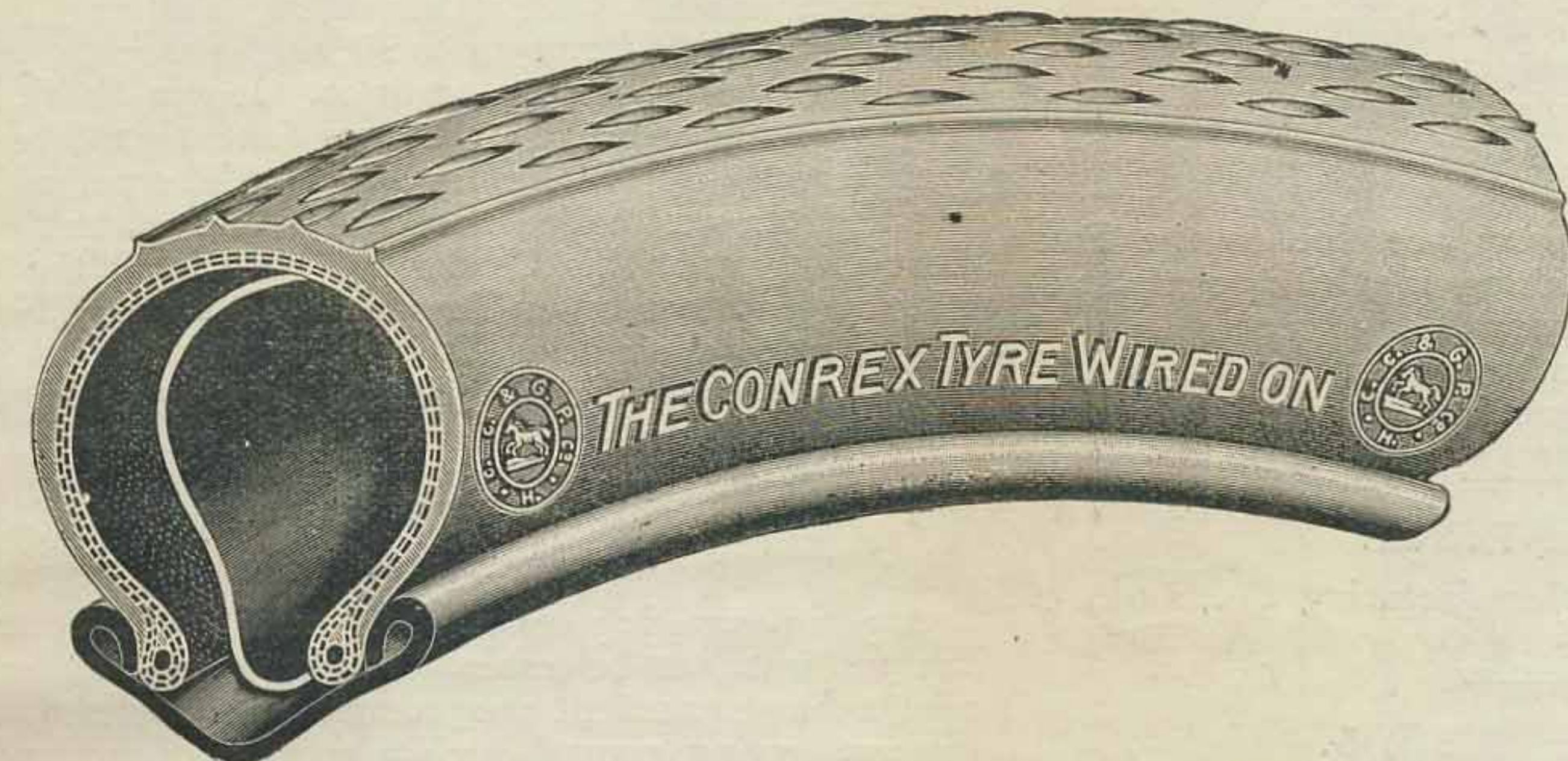
A good Wired-on Tyre at moderate price.

THE MOST PROFITABLE TYRES FOR AGENTS AND FACTORS.