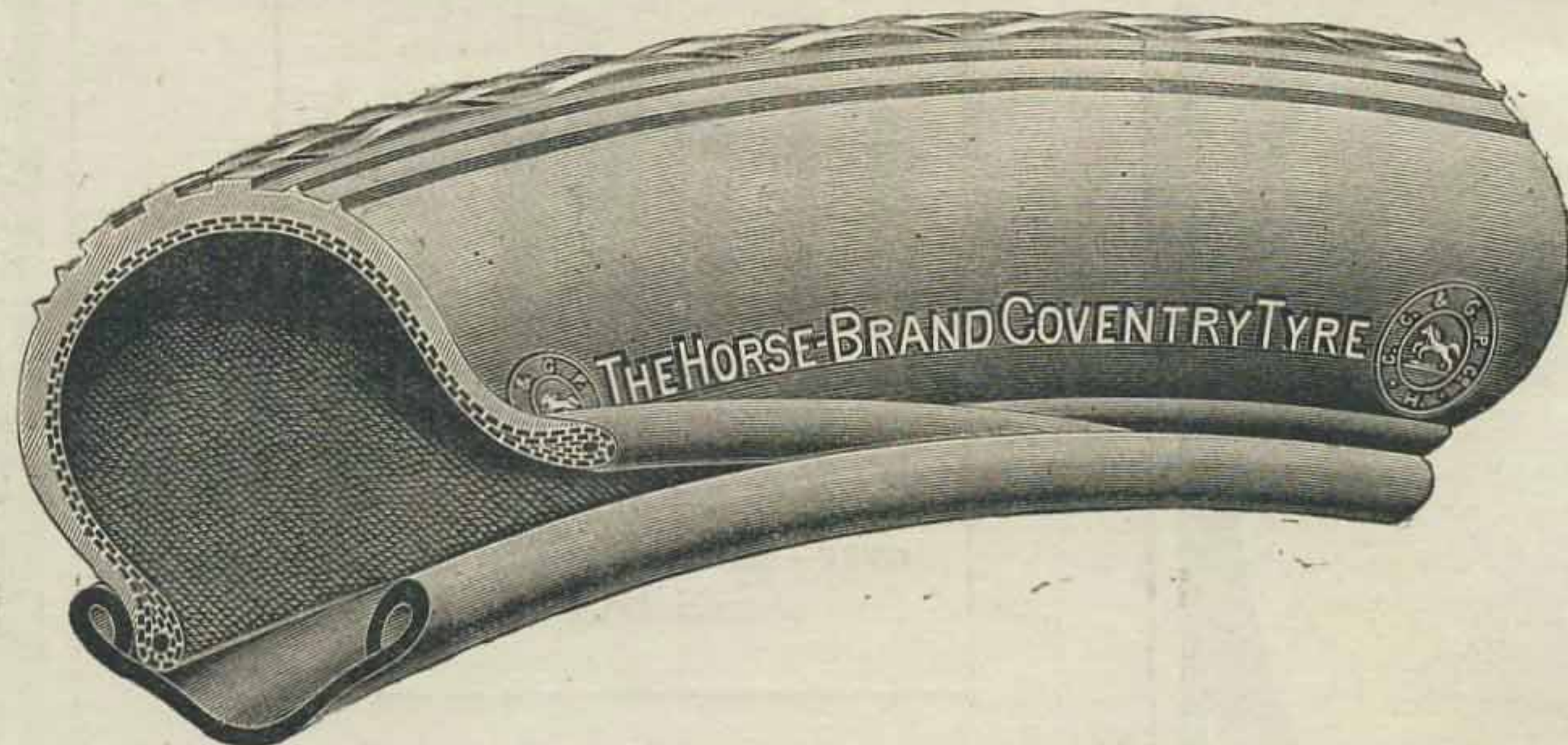
"Horse Brand" Coventry Wired-on. Guaranteed for 12 months.